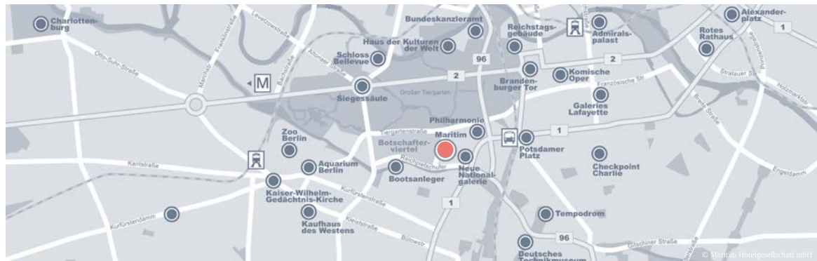
Location of Maritim Hotel in Berlin, Tiergarten

We cordially invite participants of the symposium to submit proposals for papers, posters and other presentations for consideration by the Scientific Committee. Please indicate your interest by submitting a proposal via our website.